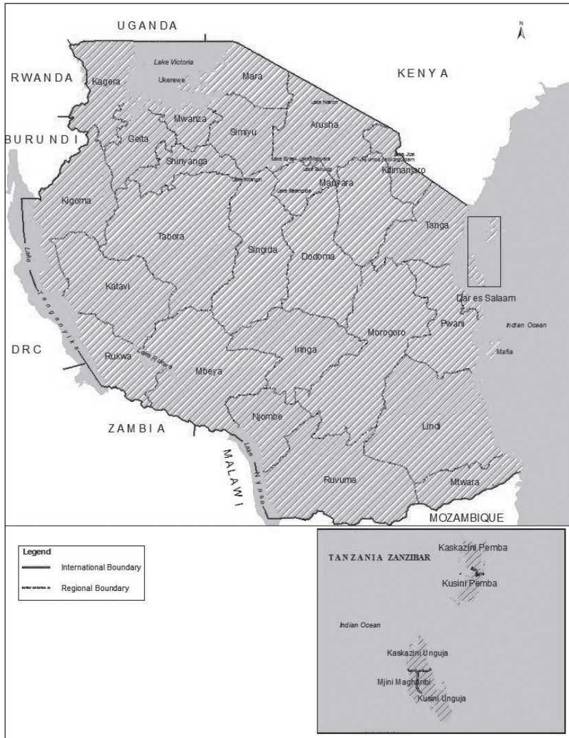
Figure 1. Map of Tanzania showing Tabora Region