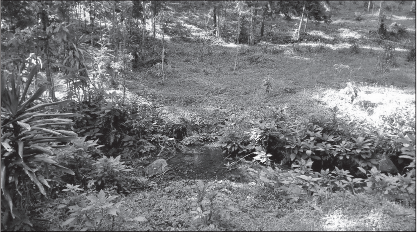
Diminishing River Una