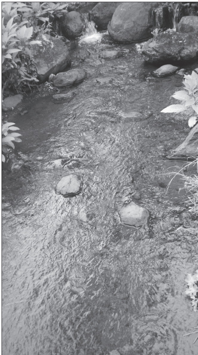
Diminishing River Kuruwi in Mshiri Village