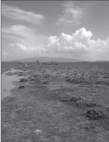
Fig. 1 Losirwa Rangelands