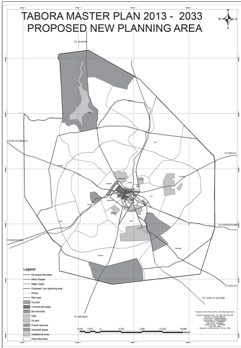
Figure 2. A map showing Tabora municipality