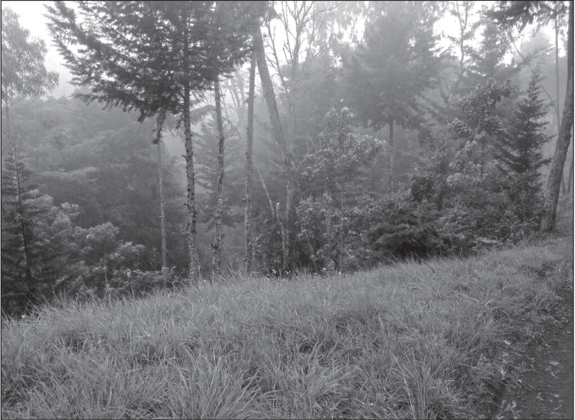
Diminishing Morning Fog as viewed in Mshiri Village